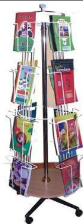
Magazine Stand (revolving)