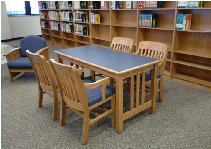
Reading Table with chairs and open shelves