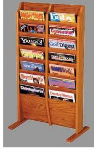
New arrival display stand and magazine rack