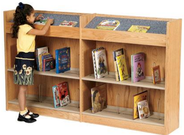
Junior Library Book rack