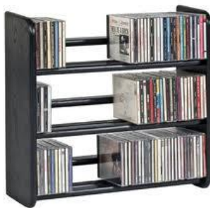
Periodical display rack (pigeon hole type), CD rack (open)